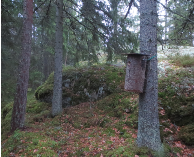
Figure 1—A typical flying squirrel nest box in Finland. Nest boxes are designed to resemble natural cavities.