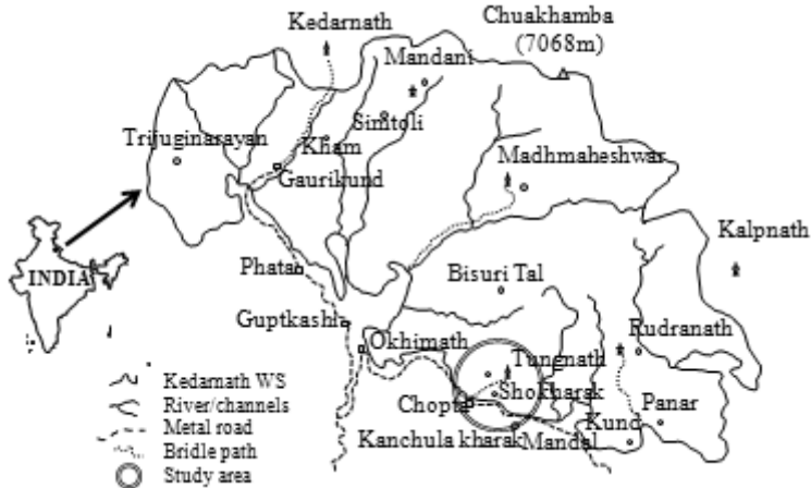
Figure 1 - Location of the study area in Kedarnath Wildlife Sanctuary.

was selected due to its suitable altitudinal range (2900-3680 m a.s.l.), variety of micro-habitat types and accessibility throughout the year.