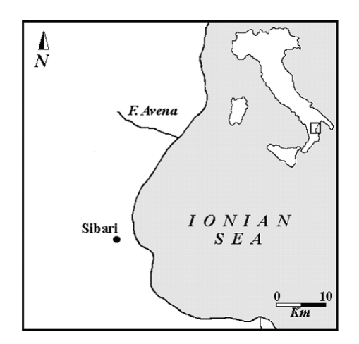
Figure 1 - Study area.

The fiumara Avena is situated on the northeast coast of Calabria region (southern Italy) (Fig.1). The climate is typical Mediterranean, with arid summers receiving <500 mm of rain (Ciancio, 1971). The vegetation of the fiumara depends on soil composition and stability and water availability, resulting in three different habitats: the riverbed, the slopes and the shores symmetrically distributed on both riversides. The slopes vary in gradient, and can be covered by the