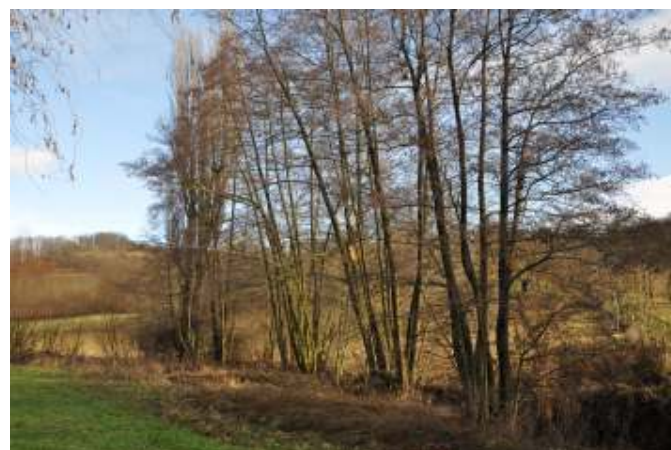
Figure 1 – Stream-side habitat dominated by poplar, alder and willow, Sternenfels-Diefenbach, Enzkreis, Southwest Germany.

Whilst there are ample studies describing drey materials in different forest ecosystems, or the location of dreys in the canopy (e.g. height above ground etc.), few studies focused or reported on the actual process of drey construction. Little is therefore known about how squirrels actually go about constructing a drey. Here we present unique footage and an analysis of recorded data of a free-ranging red squirrel building its nest.