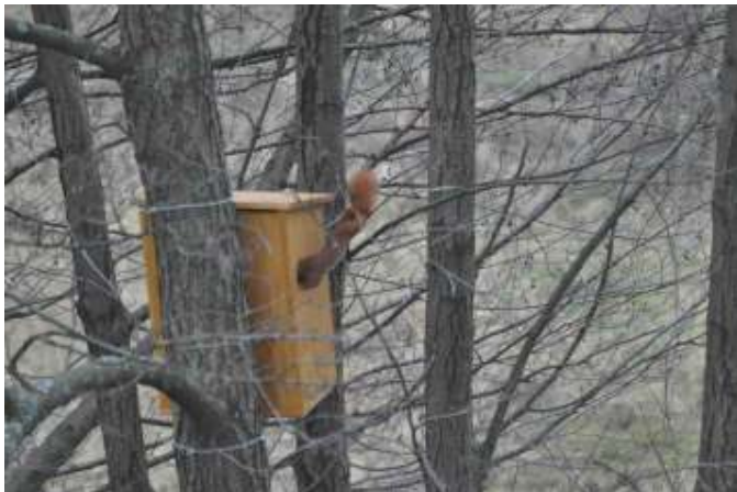
Figure 2 – Red squirrel entering the provided nestbox.