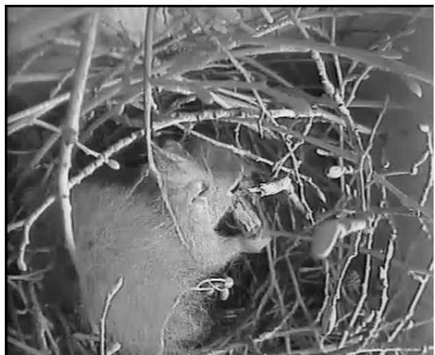
(d) For the soft inner core of the drey, the squirrel holds soft items such as grass with the front paws and uses its incisors to chew and tear them into smaller and finer items.