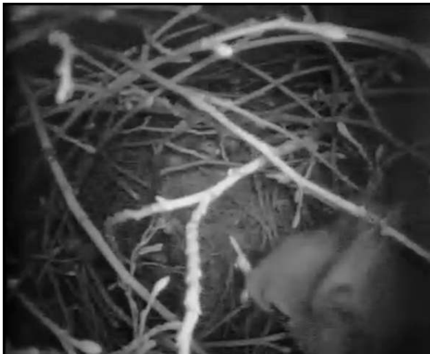
(a) Squirrels collect and transport nest material by carrying it with their mouth.