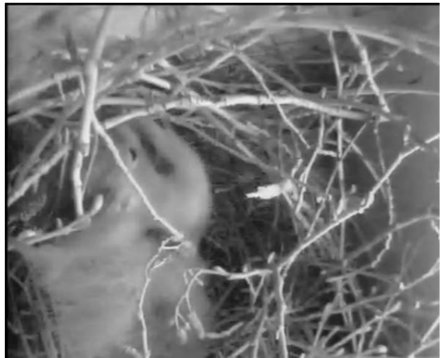
(b) During construction, twigs are gripped with the mouth and the front paws and bent and placed to create the structure.