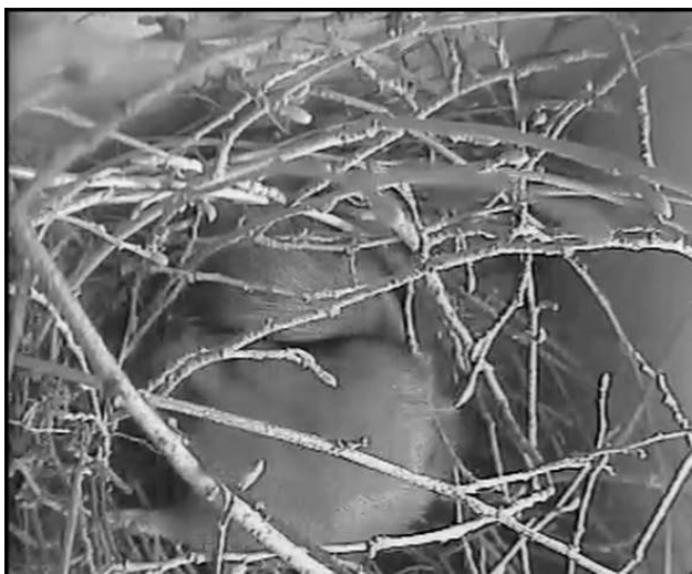
(c) The round, football-like shape of the drey is achieved by the animal taking up position in the centre of the drey. The squirrel then places items by rotating its body around this central position.