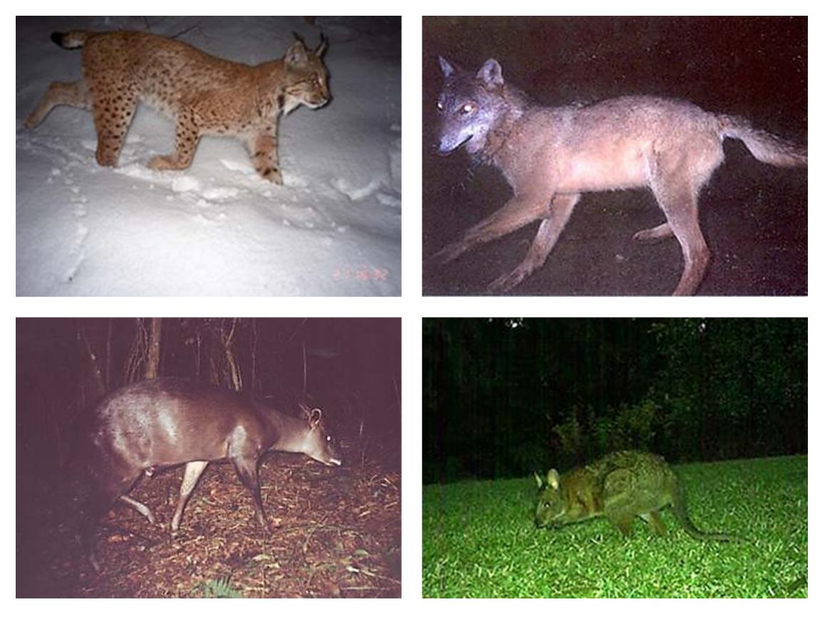
Figure 1 – Collage of camera trap images from around the world. Top left: Eurasian lynx, Lynx hynx , moving in snow in Switzerland and monitored with camera traps by KORA. Top right: a rare documentation of a wolf, Canis lupus , camera trapped in central Italy, with signs of hybridization with dog and bearing an iron snare on its neck. Bottom left: Abbott's duiker, Cephalophus spadix , a rare and threatened forest ungulate in Africa, endemic to a few sites Tanzania, whose first ever images in the wild were taken with camera traps. Bottom right: red necked pademelon, Thylogale thetis , a shy and forest-dwelling marsupial living in the eastern coastal region of Australia.