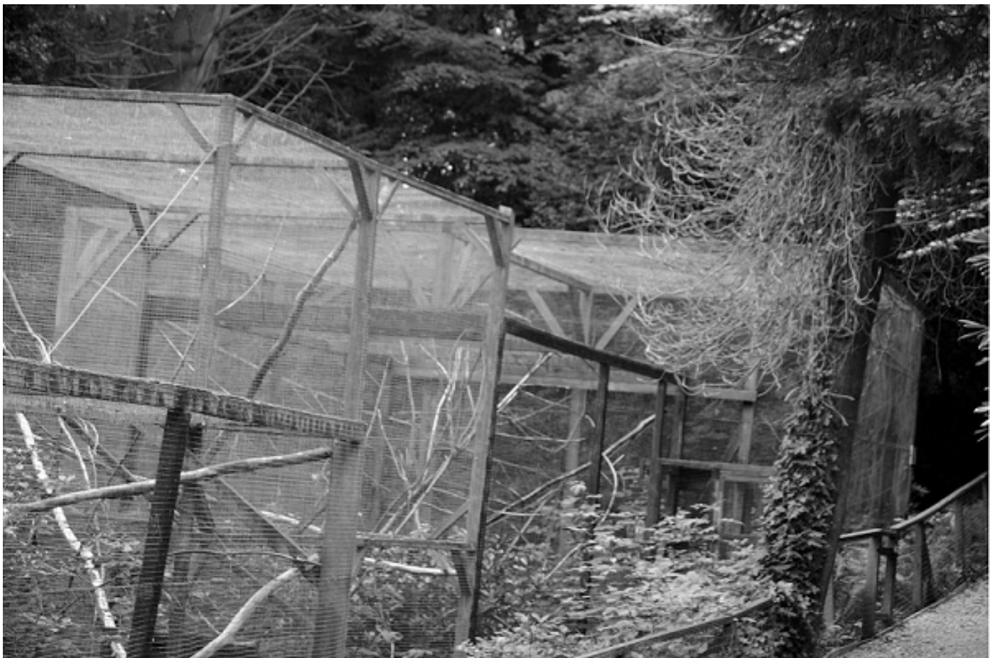
Figure 1 – The red squirrel release and captive breeding enclosures at Welsh Mountain Zoo 2011. The structure is little changed from that present in the late 1990s when re-introduction studies were undertaken.

A review of veterinary records and archived viral test results held at Moredun Research Institute, Edinburgh, not only confirmed SQPV infections in the release programmes, but also revealed that in 2004, an escaped female red squirrel was recaptured at Welsh Mountain Zoo and found to have poxvirus antibodies. To date, other red squirrels tested at the site whilst in captivity have all been SQPV antibody negative even though grey squirrels can access the mesh frame construction of the squirrel exhibit enclosure. This evidence suggesting virus exposure was limited only to released animals formed the basis for a short field study in 2011. The research sought to quantify potential inter-specific infection pathways (e.g. grooming which may dislodge fleas, or other ectoparasites and discarded food falling into the enclosure which may have saliva present) by quantifying grey squirrel activity budgets and behaviour on red squirrel enclosures at Welsh Mountain Zoo and then through PCR and ELISA tests, assessing infection rates in the sympatric grey squirrels following culling. These results, along with archived evidence sourced from unpublished manuscripts