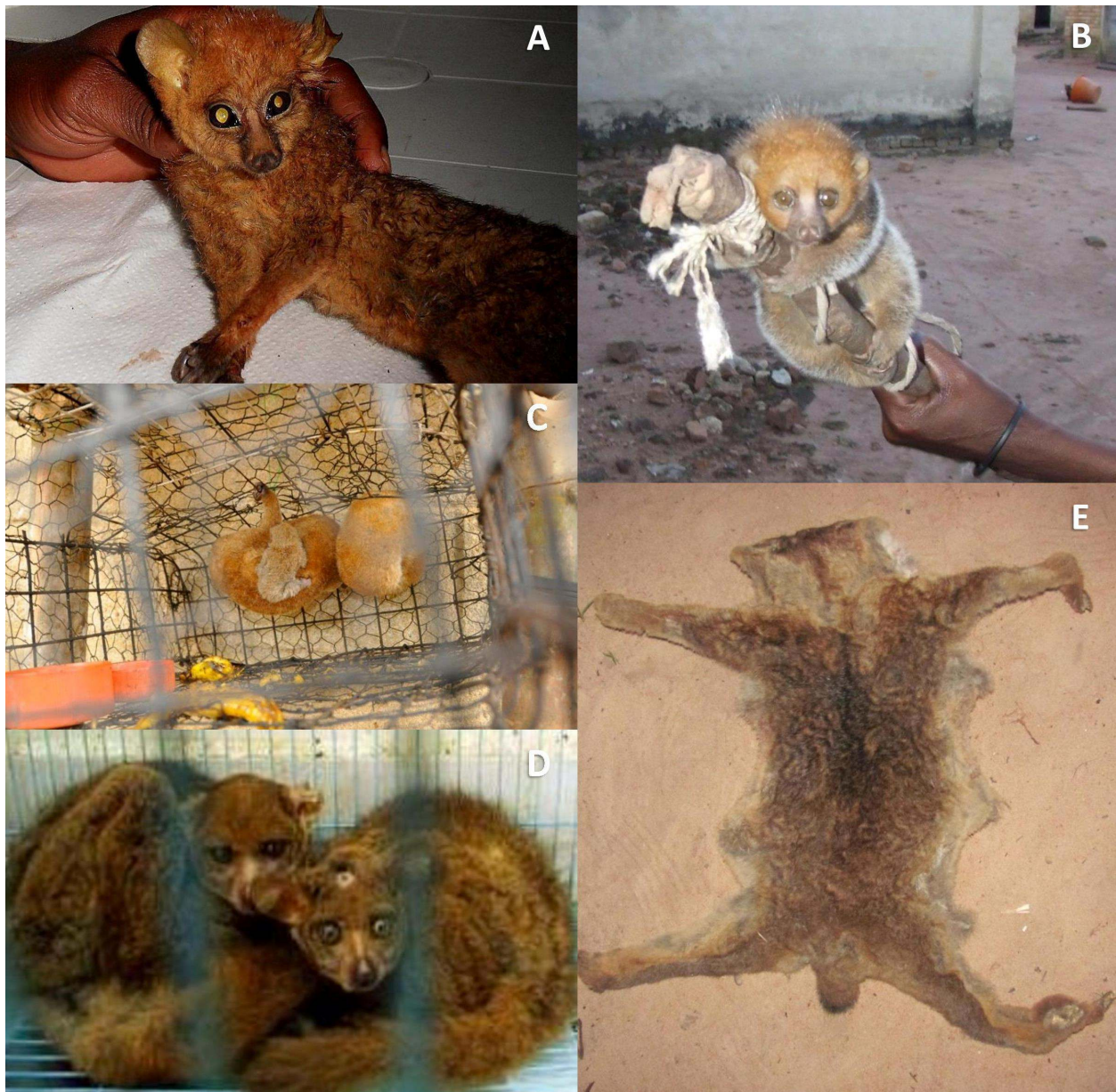
Figure 3 – (A) Arctocebus aureus hunted for bushmeat in Republic of Congo in 2010. (B) Infant Perodicticus ibeanus in the pet trade in Northern DRC in 2008. (C) Family of A. calabarensis kept as pets in Cameroon in 2012. (D) Otolemur garnettii for sale as pets in United Arab Emirates in 2009. (E) Skin of P. ibeanus for sale in Lusambo area, DRC in 2014.

epilepsy (Zambia: Baskind and Birbeck, 2005). The traditional practices using African lorisiforms described in the literature and by the respondents refer mainly to current practices and beliefs.