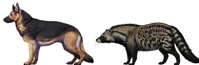
Figure 3 – Size comparison of Megaviverra carpathorum from Weže 1 with German shepherd Canis familiaris (shoulder height 70 cm). Drawing by W. Gornig.

Three mandibular body fragments from Weže 1 and Ivanovce 1 (SNM-MNH, Z 26386/65261) reveals several similarities. The massiveness and stoutness of the mandibular body, the spacing and shape of the mental foramina are well-documented. In addition, the teeth morphology is similar. There are some differences between the p4 of Weže 1 and Ivanovce 1. The main feature is the presence of a double hypoconid after the protoconid, with the larger part on the buccal side and the smaller part on the lingual side. It is quite unusual that an additional