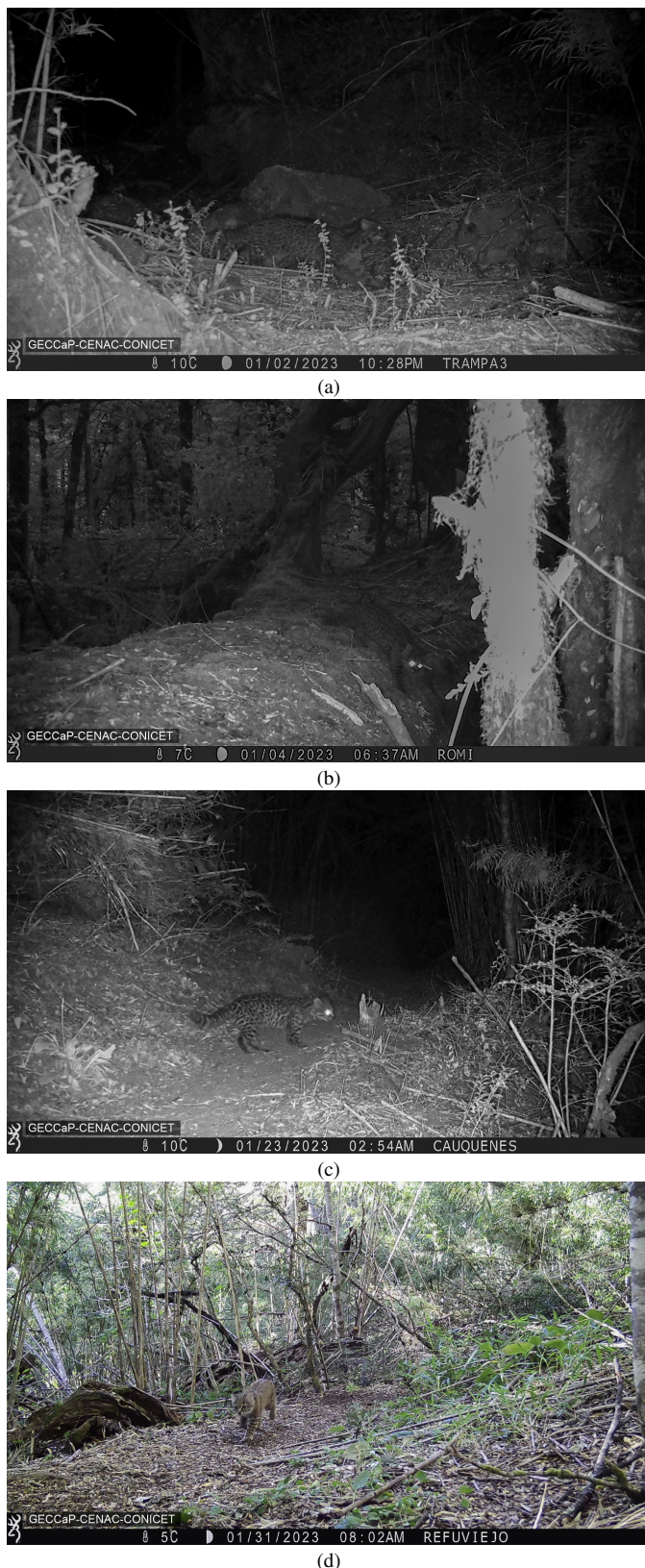
Figure 2 – The four records of guiña (a, b, c, d) obtained from the camera-trap survey in the Nahuel Huapi National Park from November 2022 to April 2023.