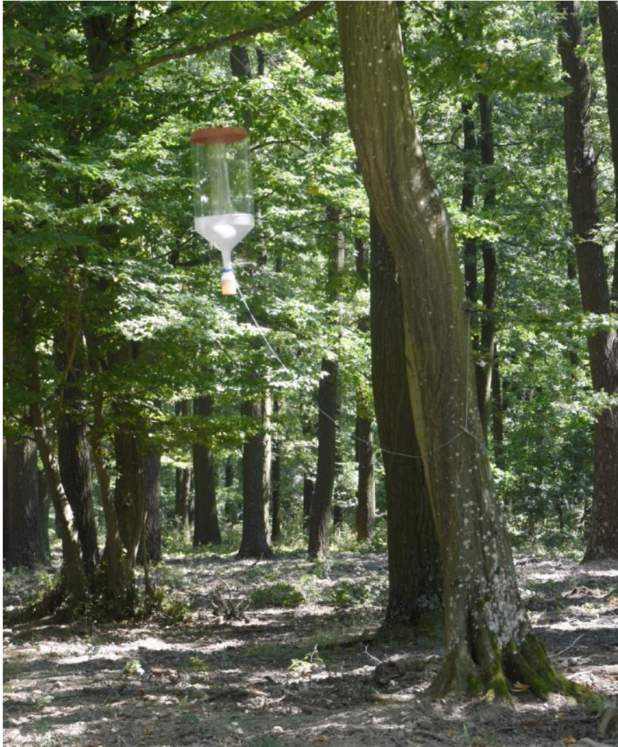
Fig 1: Window trap in oak forest.

In addition to capturing insects, our traps collected 15 adult bats, i.e. approximately one bat per 13 trap months. They were captured at 12 different traps, thus there is no evidence of spatial clustering of the bycatches. Regarding bat species composition, Pipistrellus pygmaeus (Leach, 1825), was the most common bat in the traps (11 specimens). Four other species ( Myotis alcathoe , M. bechsteinii , M. brandtii and Nyctalus noctula ) were represented by a single specimen. Nine other bat species known from the area were not caught by the traps at all. All specimens caught in traps were males except for a Myotis bechsteinii female.