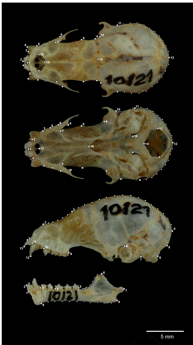
Figure 2 – Pictures of the cranium in dorsal, ventral and lateral view and mandible in lateral view of a Rhinophylla pumilio specimen (ALP 10121) showing the position of landmarks (squares) and semilandmarks (circles).

For skull shape, we used aligned two-dimensional coordinates of landmarks and semi-landmarks (Monteiro and dos Reis, 1999; Gunz and Mitteroecker, 2013) from dorsal, lateral, and ventral views of the cranium, and lateral view of the mandible as shape variables (Fig. 2, see Supplementary Materials for landmark descriptions). These images were obtained with a digital camera (Canon EOS Rebel XS, coupled with a Canon EF 100 mm f/2.8 Macro lens), and each specimen was set in a standardized position with respect to the camera lens. Landmarks and semi-landmarks were generated in the software tpsDig2 (Rohlf, 2015), and the sliding of the semi-landmarks and alignment of raw coordinates (via Generalized Procrustes Analysis) were performed in the package geomorph (Adams and Otárola-Castillo, 2013) in the R environment (R Core Team, 2020). Aligned coordinates in different cranium and mandible views were used as shape variables in subsequent analyses. In the case of dorsal and ventral views of the skull, where bilateral landmarks are present, only the symmetric component was used in the analyses.