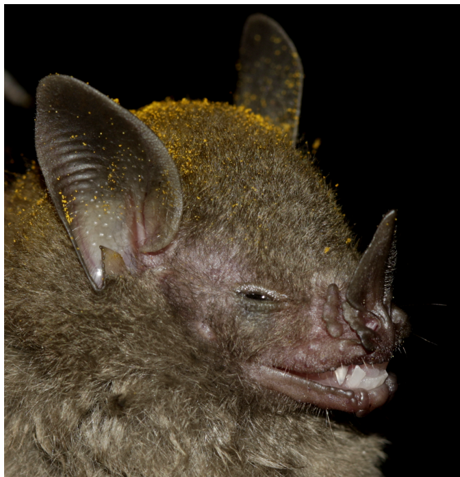
Figure 1 – An individual of Rhinophylla pumilio , captured with pollen by MN and IL at Reserva Natural Vale, municipality of Linhares, northern state of Espírito Santo, southeastern Brazil.

the abundance of specific items, that is, on bat food preferences (Fenton et al., 1998; Voigt et al., 2009; Ragusa-Netto and Santos, 2015; Lima et al., 2016). In addition, molecular methods are being used in order to achieve more detailed information on the taxonomy of food content, as species classifications are not always possible solely on morphological analyses of food items (Voigt et al., 2009). These methods are important to understand bat feeding ecology. However, they can only identify food items on bat diets over a short time-span, showing what bats consumed in the last hours prior to sampling (Roswag et al., 2014). Therefore, several studies have relied on stable isotopes in order to quantify the information on the nutrients that integrate into animal tissue over longer periods (Bolnick et al., 2003; Voigt and Matt, 2004; Rex et al., 2010; Frick et al., 2014; Roswag et al., 2014).