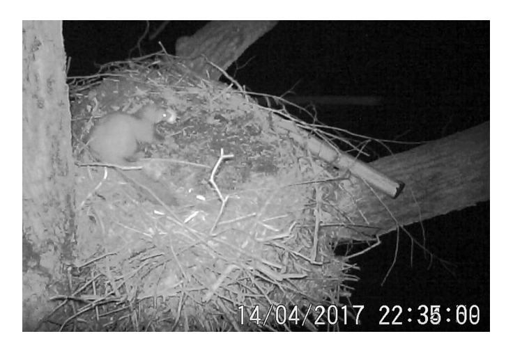
Figure 6 – Freeze-frame taken from a video of a pine marten with one black stork egg (Kolumna3 nest). No adult black storks were guarding the nest.

their bodies, spread their wings, and started to utter loud, low-pitched, and guttural growls interspersed with bill clattering. The pine marten stopped about 0.8 m in front of the nestlings and immediately after the pine marten heard the voices of the chicks, it turned back on the same branch and disappeared out of the camera frame. The nestlings calmed down and sat down at 01:45:35. Adult storks were not guarding the nestlings that night. The pine marten was not observed again during the time the chicks remained in the nest. Two nestlings were reared in that nest and the last left the nest on 28 August 2017.