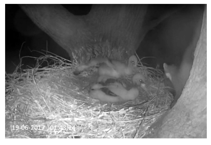
Figure 5 – Freeze-frame taken from a video of a pine marten approaching a black stork nest. No adult black storks were guarding the nest.