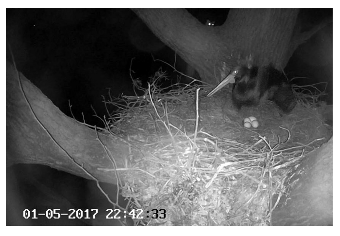
Figure 3 – Pine marten climbing the tree behind a black stork nest where the stork was incubating four eggs (Grotniki2 nest).