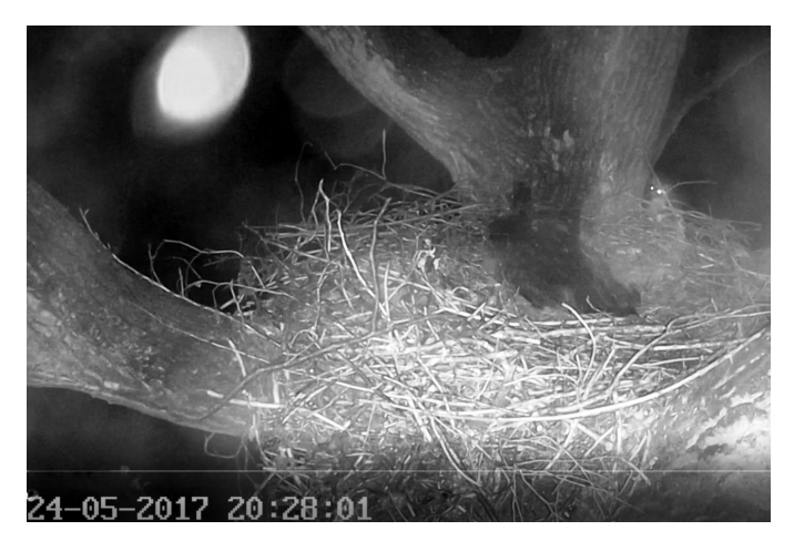
Figure 4 – Freeze-frame taken from a video where a pine marten approaches the nest with a black stork brooding small nestlings.

At the same nest (Grotniki2) on 19 June 2017 at 01:43 (UTC + 02:00), the network camera recorded a pine marten walking down a large bough towards the nest (Fig. 5). Of the four black stork nestlings that hatched in that nest, two nestlings were predated by the goshawk Accipiter gentilis in the first half of June. The two black stork nestlings which remained were lying silently on the nest floor. The age of the older nestling was 30 days. At 01:43:25 the alarmed nestlings raised