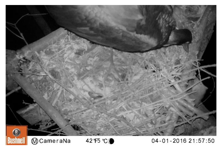
Figure 2 - Pine marten attempting to enter black stork nest (Kolumnal).

A pine marten was recorded at the same nest (Grotniki2) on 24 May 2017 at 20:28:00 (UTC + 02:00). The weather was very rainy that evening. The pine marten emerged from under the nest (Fig. 4) where the stork was brooding four small nestlings. The oldest nestling was four days old (hatching day = age one day). The stork stood up, spreading its wings, and turned towards the pine marten. The pine marten withdrew immediately and hid under the nest. The stork stood with its